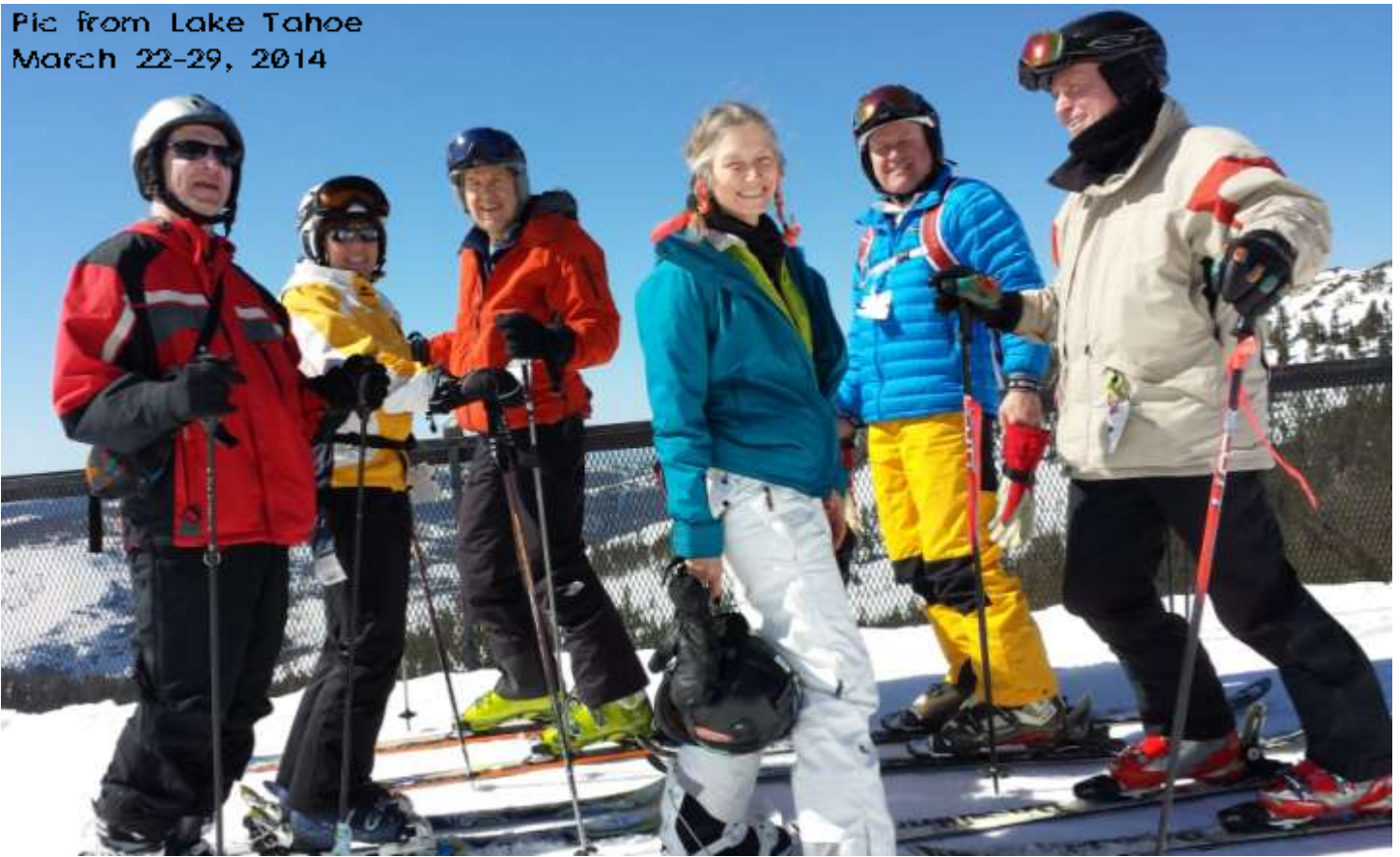
Pic from Lake Tahoe March 22-29, 2014