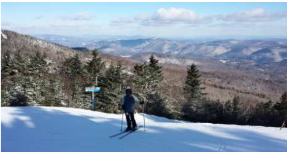
Vista from Killington Peak. 1.10.2015