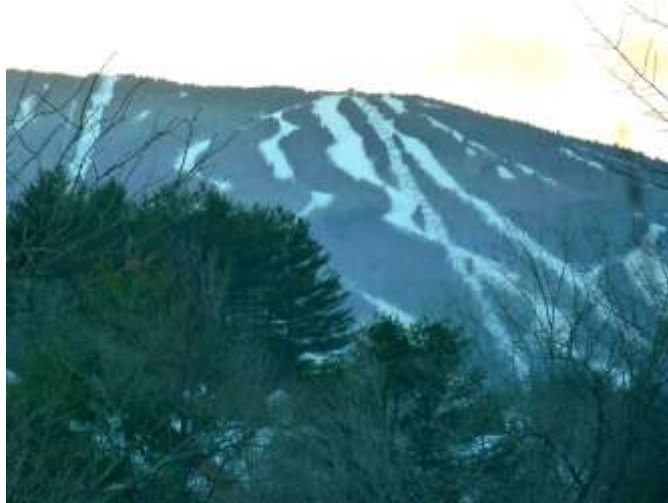
Sunset view of the Okemo slopes from The Pointe Hotel room. 1.9.2015

A sudden burst of comments on the BSC Facebook page was veritable proof that the Okemo bus trip successfully launched the ski season. Special thanks to Viv Lettsome for posting a broad range of photos that included scenes from Ludlow and Killington.