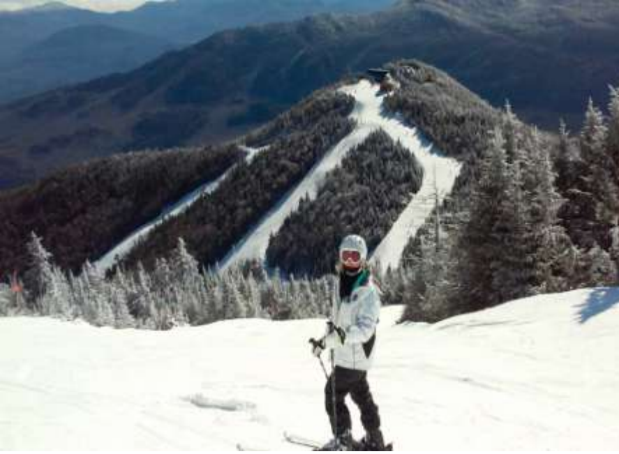
View from Paron's Run on Whiteface Summit

The BSC joined several Blue Ridge Ski Council clubs to revive the tradition of Eastern Winter Carnival at historic Lake Placid in the Adirondack mountains of New York. We shared one bus with members from several other clubs, including: Columbia; Fagowees; Snow Searchers; Club Crabtowne; and the most recent addition, NGA.