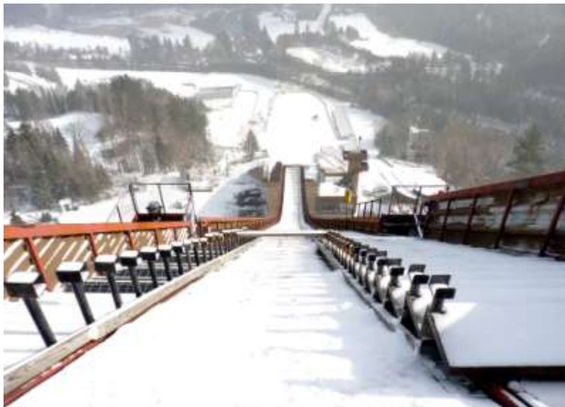
View from top of Olympic Ski Jump

bitter cold with zero degrees at the summit and wind at 25 miles per hour. The summit chair was closed due to the wind velocity. A few members skied, but most toured the Olympic Ski Jump and Olympic Museum. In town, speed-skating athletes were training on the outdoor Olympic Oval ice rink. Last glimpses of the frozen lake focused on a dogsledder. As we boarded the bus, we knew that we were returning to Baltimore with many memories of Olympic history and we were all quite proud to have skied on the same slopes as world champions.