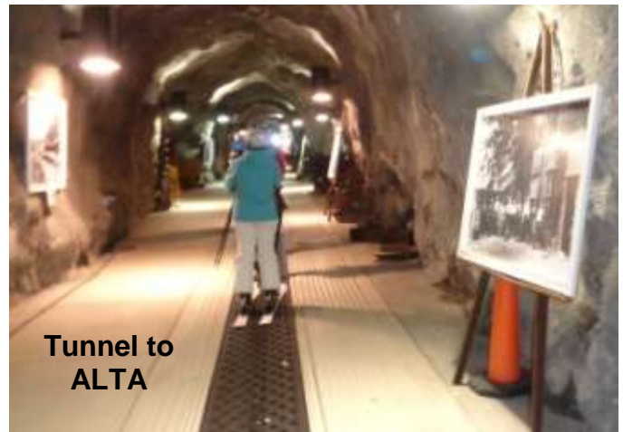
Tunnel to ALTA