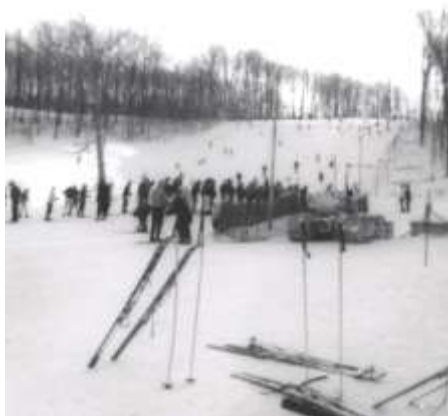
A photo of Oregon Ridge.

Myron M Oppenheimer 443-253-4413 myronopp@comcast.net